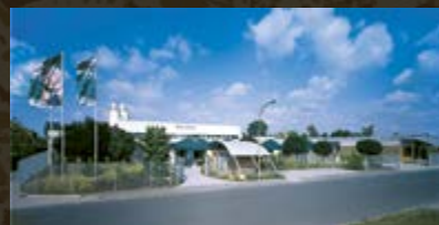
Silikal production and administration in Mainhausen, near Frankfurt/Main, Germany.

Contact us. We would be pleased to go into detail with you – at no cost or obligation to you, of course.